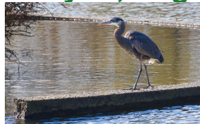
Attendees went birding at Finley Wildlife Refuge