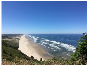
Oregon Coast, site of Sunday field trip