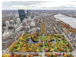
Boston from above