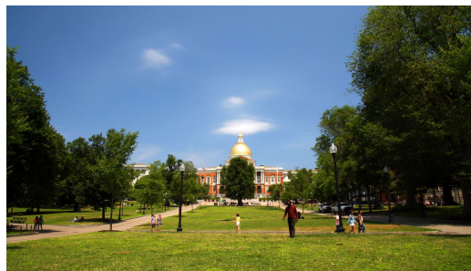
Massachusetts State House

aseh news is a publication of the American Society for Environmental History